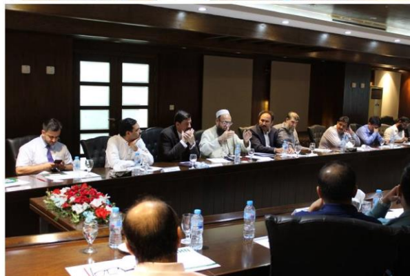
Session 2 - Presentations by the Panelists and Questions & Answers