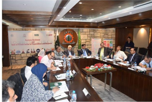
Session 3 - Presentation by the Panelist and Questions & Answers