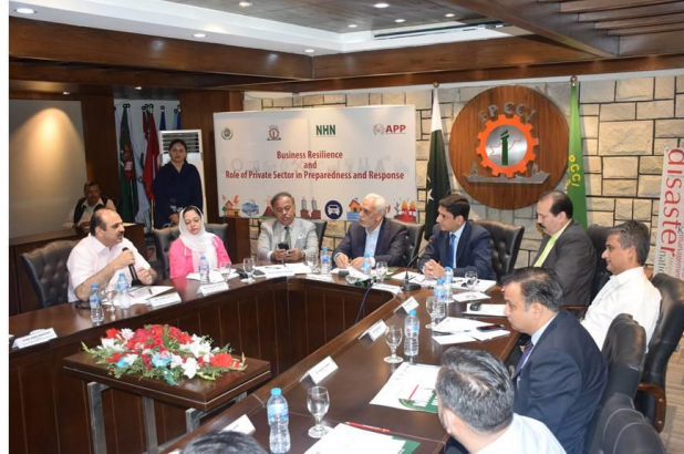
Session 1 - Presentation by the Panelist and Questions & Answers